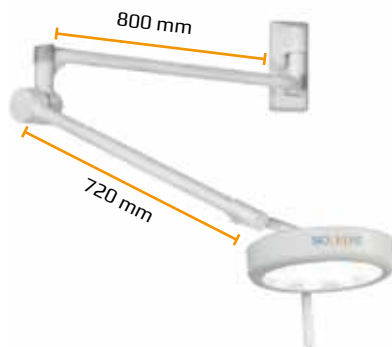
• Wall mounted