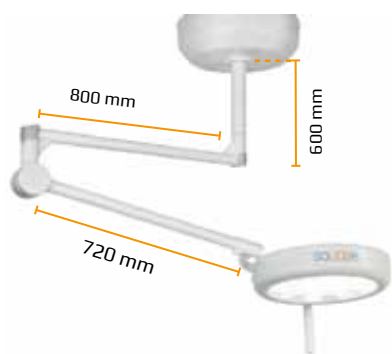
• Ceiling mounted (single or double configuration)

• SOLED15 is available in the following versions